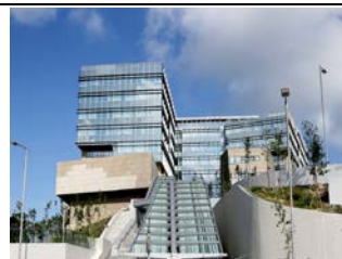
Photo: Lee Shau Kee Business Building